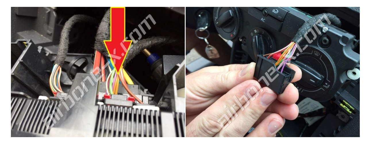
Remove connector from the climate control panel. Work on to remove insulation tape from the harness to get access to two mentioned wires as shown bellow.

Unscrew climate/heating control panel, pull it off and locate connector with INFO-CAN lines. These will be orange with green strip and orange with brown strip. Connectors at the climate/heating panel may vary on different models, however what we are looking for are orange/green and orange/brown wires.